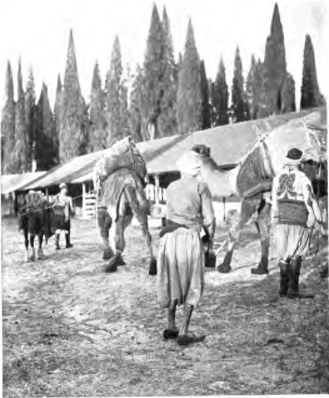
A CAMEL CARAVANERAI, SMYRNA